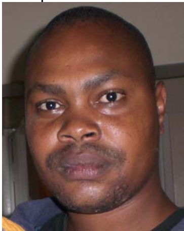
Me (The Victim)